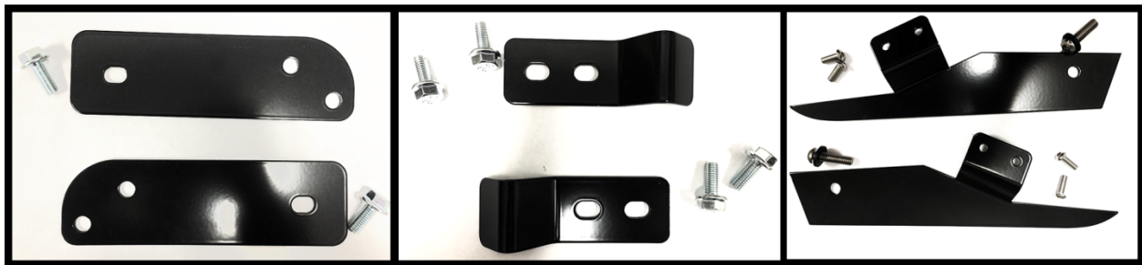
Front Brackets & Hardware